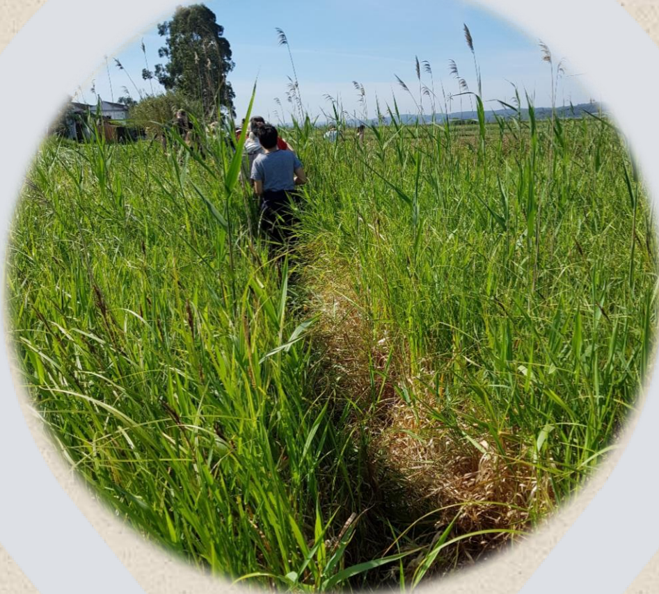
overgrown field exploration