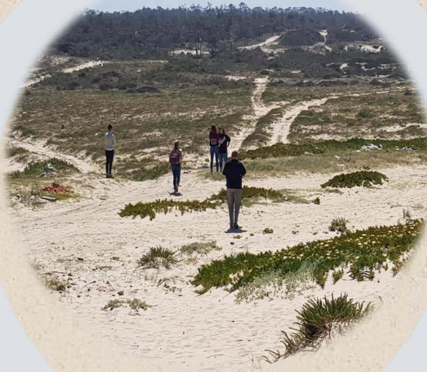
dune search area