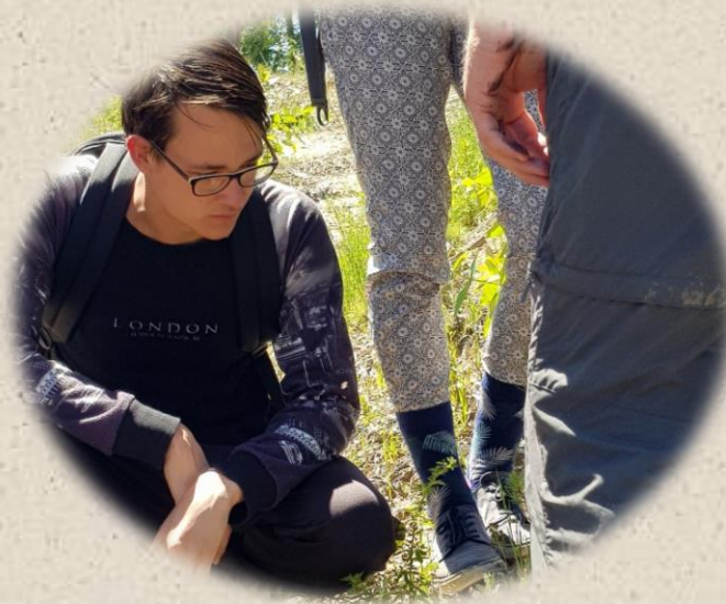
students on forest search

Depending on the institution policy, participants can earn 3 EC's (European Credits). For credit enquiries contact us with details from your faculty.